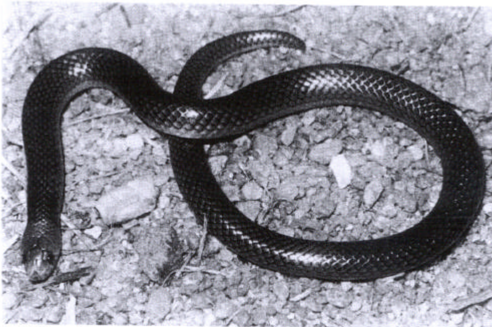
Fig. 1. Holotype of Simoselaps morrissi sp. nov. (NTM R.22951) from Elcho Island, Arnhem Land, Northern Territory, photographed in life. Note abraded rostral scale.

Body. Snout-vent length to 268 mm. Tail length 11.9–12.5% of SVL. Body width 3.5–3.7% of SVL. Scales smooth. Mid-body scale rows 15. Ventral scales 138–141 (mean = 140). Subcaudal scales 20–21 (mean = 20.5). Total ventral and subcaudal scales 159–161 (mean = 160). Anal and subcaudal scales divided. Tail terminating in bluntly rounded scale.