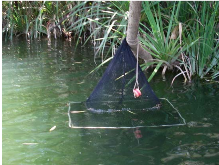
Figure 1. Baited cathedral turtle trap set under Pandanus aquaticus .