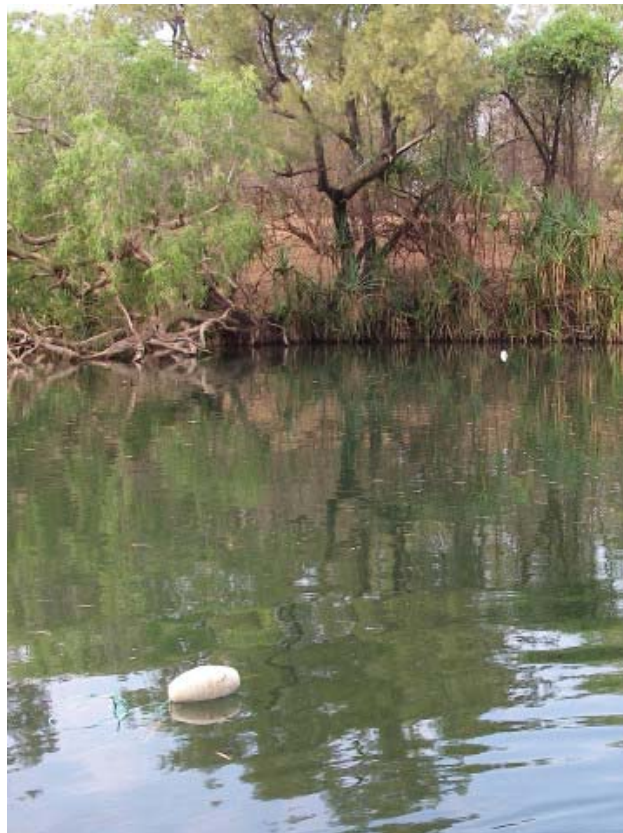
Figure 2. Multipanel gill-net bottom set at Station GD08-02.