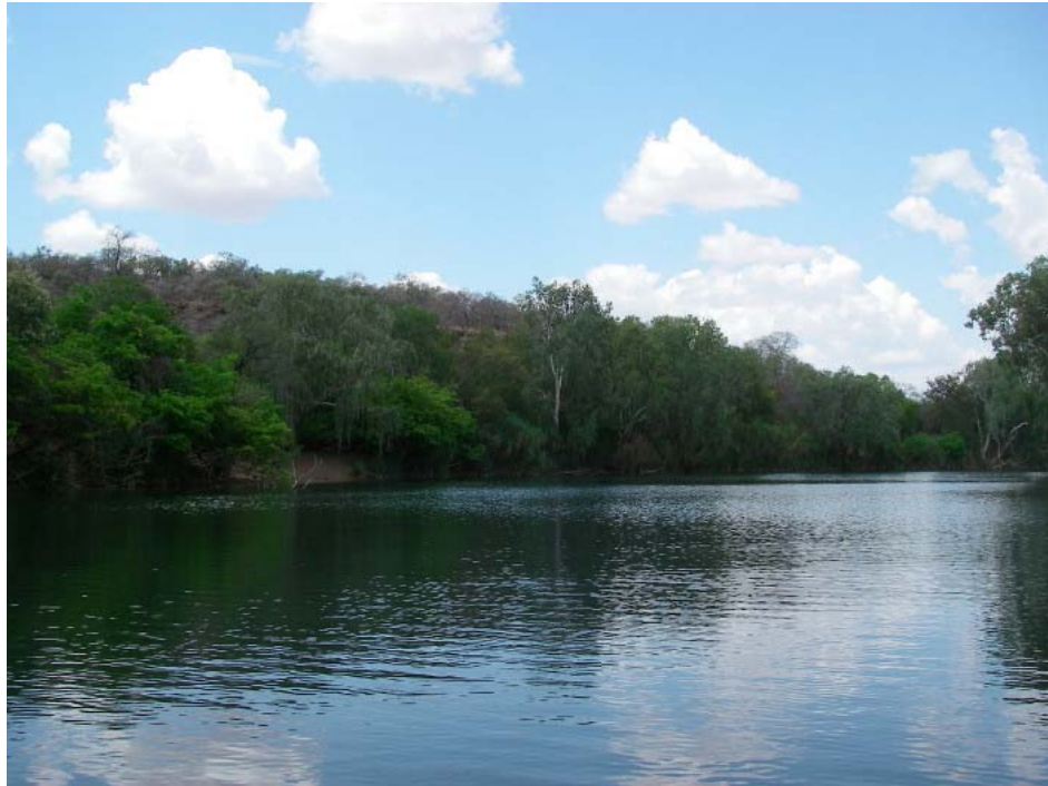
Figure 4. Near eastern end of waterhole, Station GD08-03

Roper River, Elsey/Moroak Stations, near eastern end of waterhole. 14°49.723'S 133°41.884'E. Depth 6-8 m, water temp 28.6° C, salinity 0.7 ppt, conductivity 1543 µS, water colour green, river width 40 m. 23 September 2008. 1325-1425 hrs. Collectors G. Dally and S. Gregg, by multipanel gill-net bottom set across width of river.