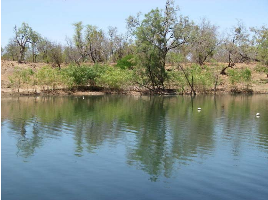
Figure 6. Gill-net set near eastern end of waterhole, Station GD08-09

Roper River, Eley/Moroak Stations, near eastern end of waterhole. 14°49.529'S 133°42.422'E. Depth 4-5 m, water temp 28.0° C, salinity 0.7 ppt, conductivity 1528 µS, water colour green, river width 40 m. 25 September 2008. 1100-1200 hrs. Collectors G. Dally, S. Gregg and M. Daniel, by multipanel gill-net (shortened to large mesh end only) bottom set from bank to midstream.