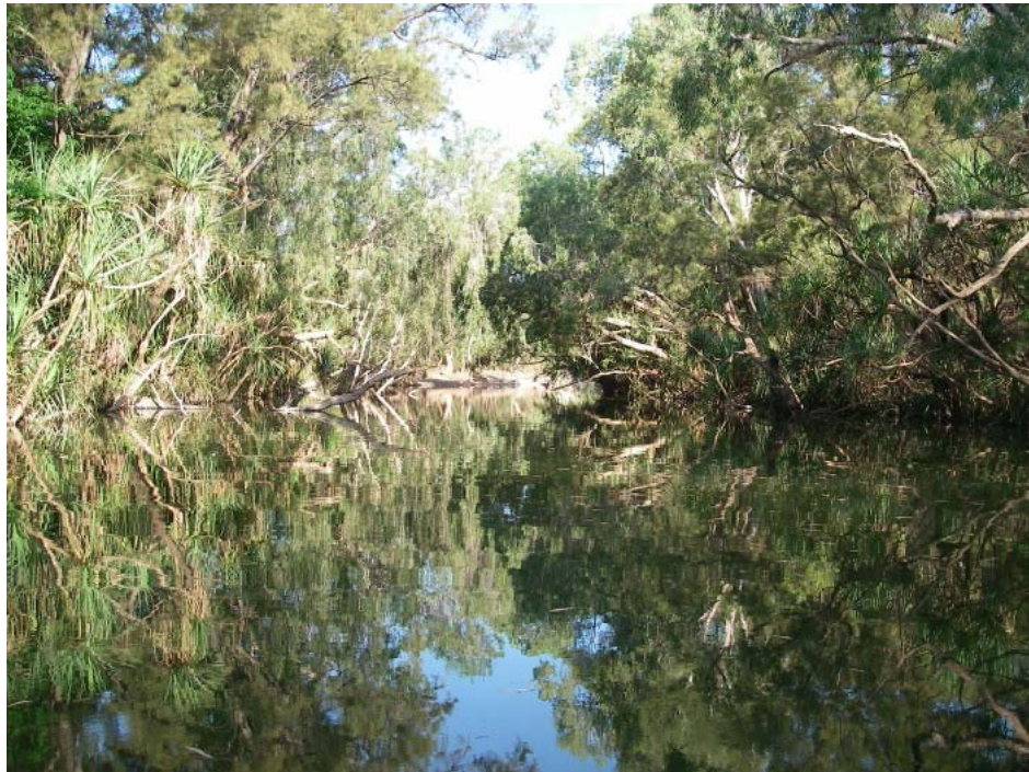
Figure 3. Western end of waterhole, Station GD08-01

Roper River, Eley/Moroak Stations, western end of waterhole. 14°49.514'S 133°41.048'E. Depth 3-5 m, water temp 28.1° C, salinity 0.7 parts per thousand (ppt), water colour green, river width 30 m. 22 September 2008. Collectors G. Dally, S. Gregg and M. Daniel. Three baited set lines and two baited cathedral turtle traps (positioned under Pandanus aquaticus ) set at 1700 hr over a 300 m section of river and left overnight.